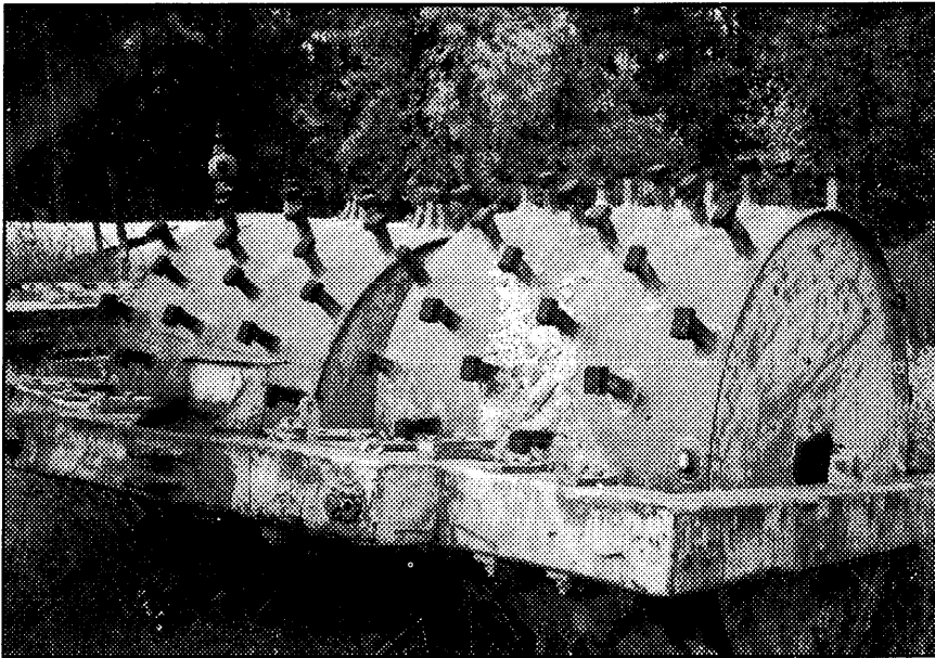
Figure 1. Sheep's foot roller.

the soil on the feet extending from the drum. Adequate compaction will require at least four to six passes of the roller over all of the pond bottom and sides. Tractor-drawn wheeled dirt pans also can be used over the dam or levee, although they do not compact as well as a roller.